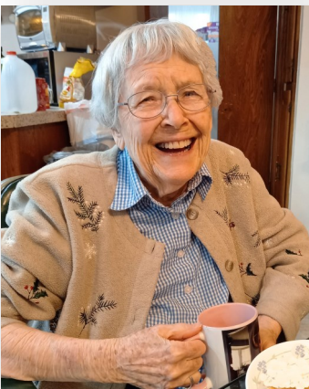
Laughing at her joke. 😊

The next day at lunch I asked Mom what she remembered about the excitement of the day before. She told me that three cute paramedics came and picked her up off the floor when she fell, cleaned up the blood, and took her in an ambulance to the hospital. When I mentioned that her blood pressure was pretty high at the hospital, she quipped, "Those guys must have been cuter than I thought!" We laughed so hard! What a character! I am beyond blessed to have her in my home.