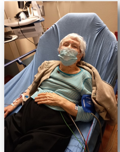
Hangin' out at the ER

Exactly a week later she added excitement to all of our lives with a nasty fall that resulted in a head wound and lots of bleeding. Several paramedics and an ambulance ride later, she and I found ourselves in the ER for five hours where she got numerous CT scans and X-rays to rule out bleeding in the brain and any fractures that would require treatment or hospitalization. Thank God all was miraculously well except for being bruised and sore—and having three broken ribs (ouch!), so she was able to come home to us.