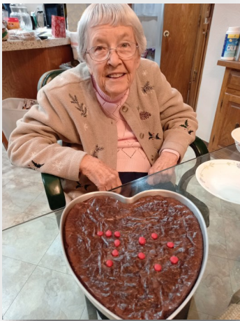
Humble celebration for Mom's 70th Anniversary

On Sunday, February 14—Valentines Day, Mom (93 years old now!) celebrated her 70th anniversary ! We were snowed/iced in, so it wasn't a fancy celebration but she did get a heart-shaped brownie with "70" drawn in little red cinnamints.