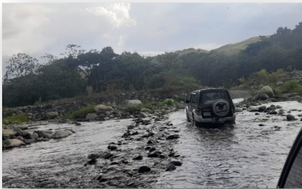
The "new" car in action en route to one of the villages.