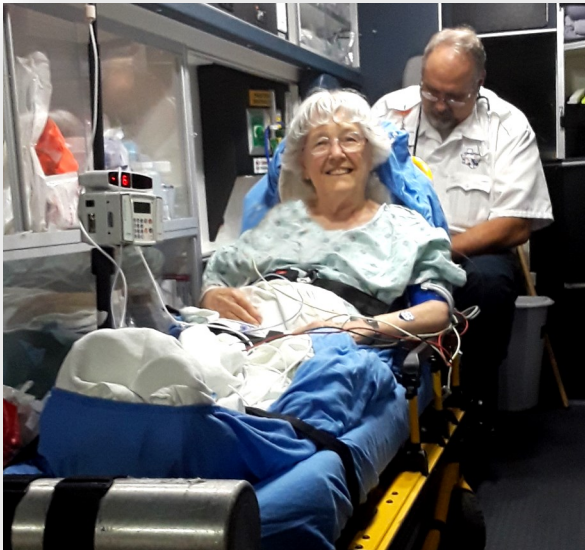
Mom taking her first ever ambulance ride after her stroke.