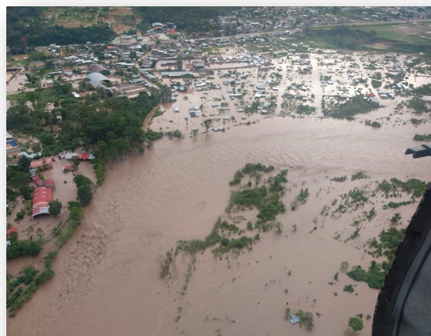
An entire town inundated

Towards the end of March, torrential rains in the area of Peru where I (Judy) used to work—and beyond—caused the Perené River on which Churingaveni is built to seriously overflow its banks and wreak havoc in lower-lying areas. Churingaveni itself is on a bit of a hill so the village was not flooded, though some people there lost their gardens. Parts of the highway that connects that area of Peru with the capital city were destroyed by the river. Please pray for restoration for those who have lost so much, and that the believers in the area will be helpful and compassionate, drawing others to the Lord through their actions and words.