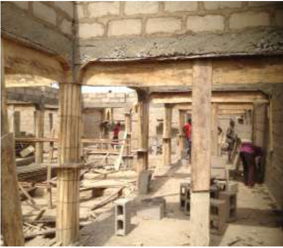
Ministry of Mercy's Health Clinic