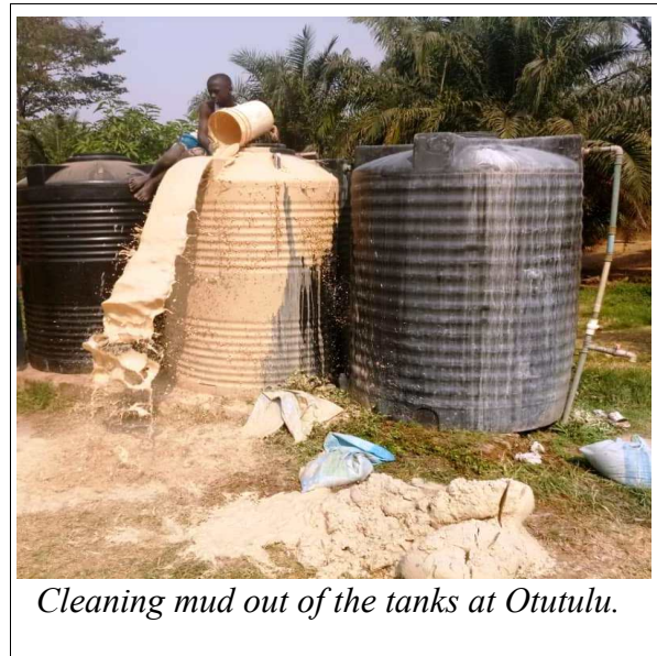
Cleaning mud out of the tanks at Otutulu.

This campus houses 100 children, the staff, and the MoM Medical Center.