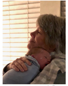
New nose and first grandchild