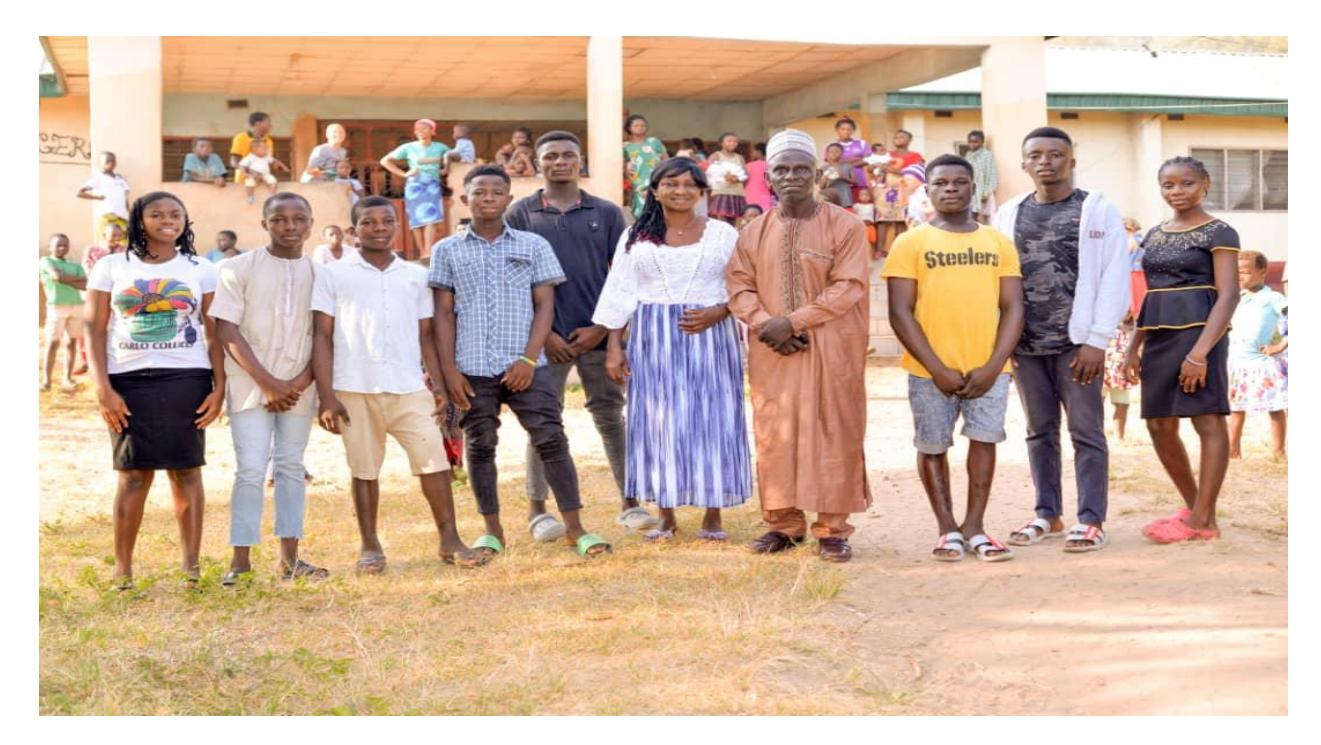
Daddy and Mommy with some of the outgoing children

By means of divine provision, we were able to buy a Study Bible and an Igala hymn book for each of our 9 older children as parting gifts.