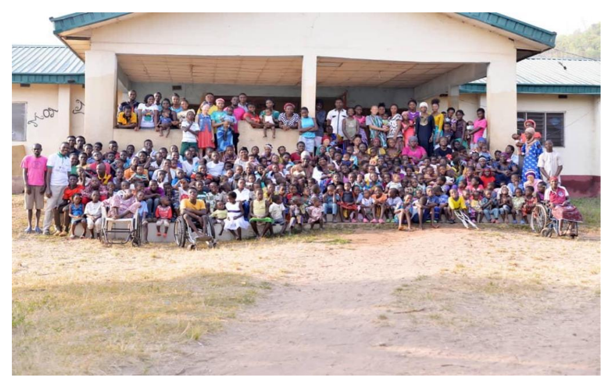
MoM Otutulu family as at December 2020

• Below are MoM Photos for Otutulu and Lokoja Orphanages respectively as at December 2020.