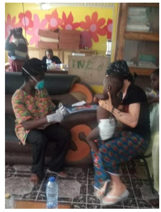
The clinic outlet continues to run its usual services to orphans and staff in the orphanage.