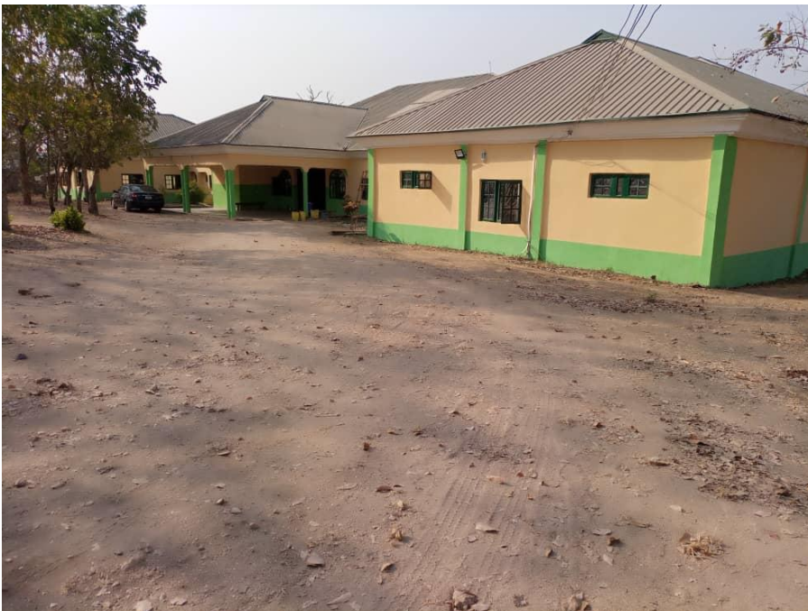
MoM MEDICAL IN 2021