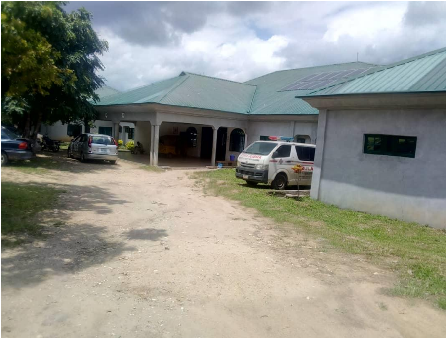
MoM MEDICAL CENTER IN 2020

MoM Medical Center Now Wears a New Look: The New Year 2021 comes with a new look for our Medical Center. We look forward to new things this year. May God fulfill this desire in ways He will choose to.