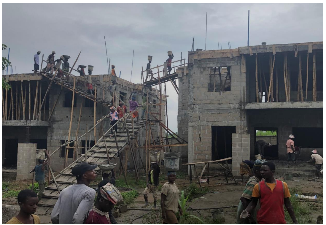
Decking of the 2nd suspended floor of the two residential buildings in progress

Please, pray that the Lord may supply resources to bring these capitalintensive projects to completion as soon as possible.