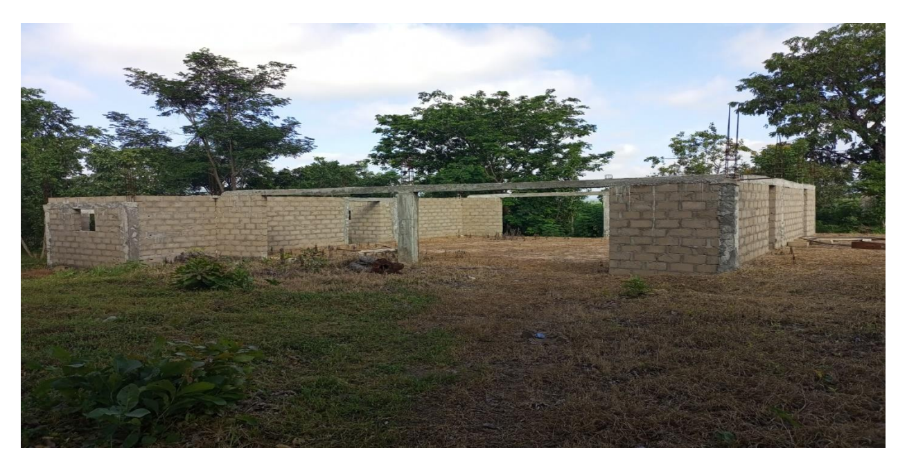
Kitchen/dining building in progress