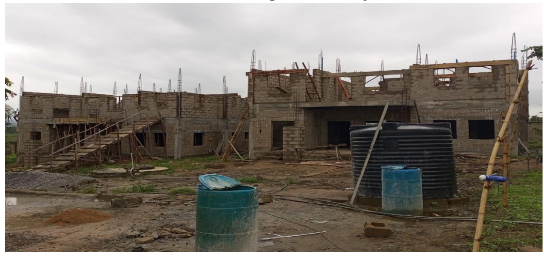
Staff quarters building in progress

In the month of July, we continued work on our building projects at the orphanage in Lokoja. We have completed walling of the first suspended floor for the two staff quarters building and carpenters are on site for the wood work of the second suspended floor. Work on the kitchen/dining building is currently on hold as we are in the process of introducing more floors to the original design. Please pray for resources to be able to complete these projects in no distant time as we are in dire need of more space in Lokoja.