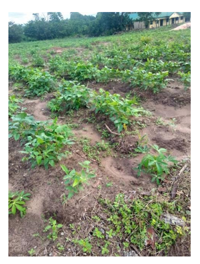
Beans farm around the school compound

Our various farming forms continue to thrive. Our tractor is really a blessing.