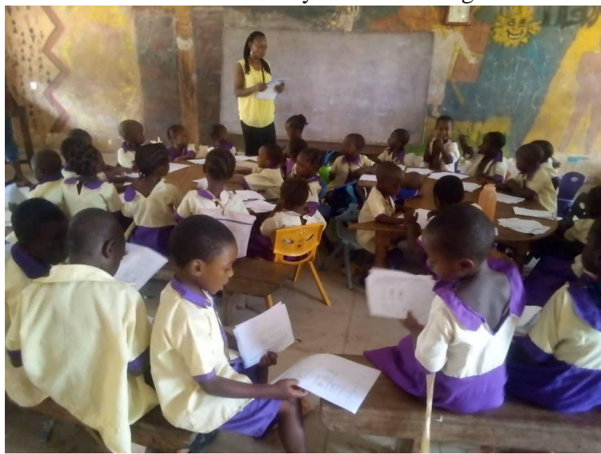
FCS (Fellowship of Christian Students) at MoM Christian Academy (MoMCA): Students meet for fellowship on the school compound every Friday after school hours.

A cross-section of the nursery classes writing their end-of-term exam on March 28, 2023